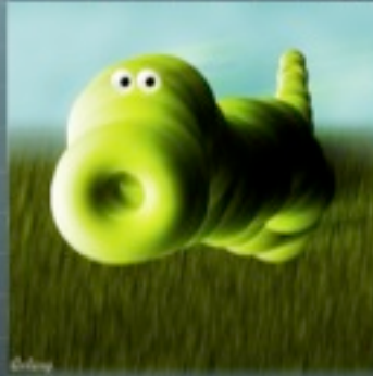
The Flying Doughnut Monster by mario