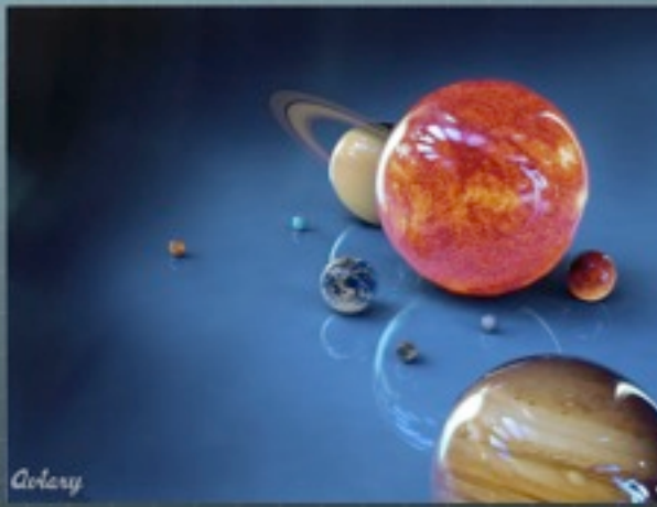
The Grand Scale by magnumx6x