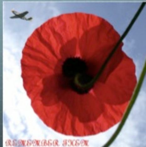
Remember Them by pritikiti