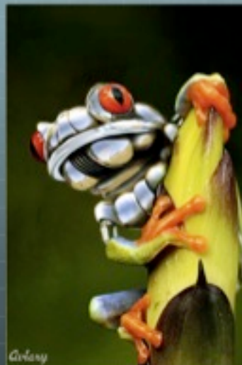
Robofrog by meowza